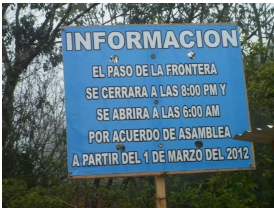
Photograph 3. Border crossing regulations

Source: Tzisco, Chiapas, Mexico. Photograph taken by the author.