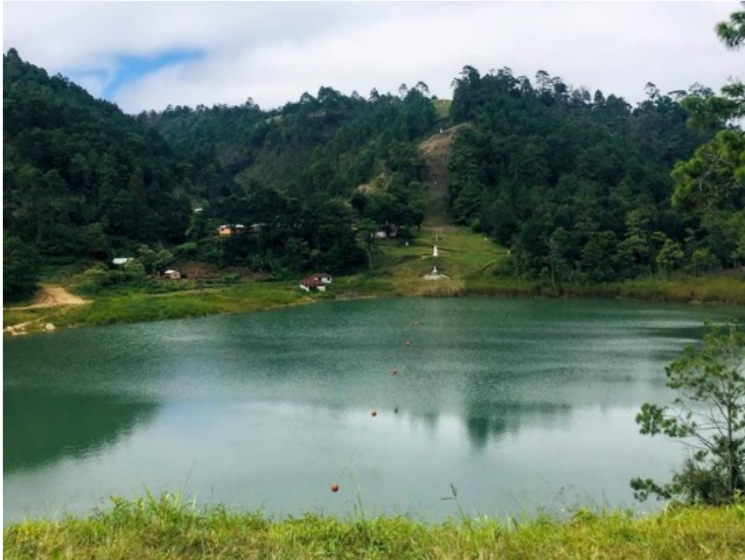
Photograph 1. Mexico-Guatemala International Lagoon

The international division of the lagoon located between Tzisco and El Quetzal is demarcated by the line of buoys.