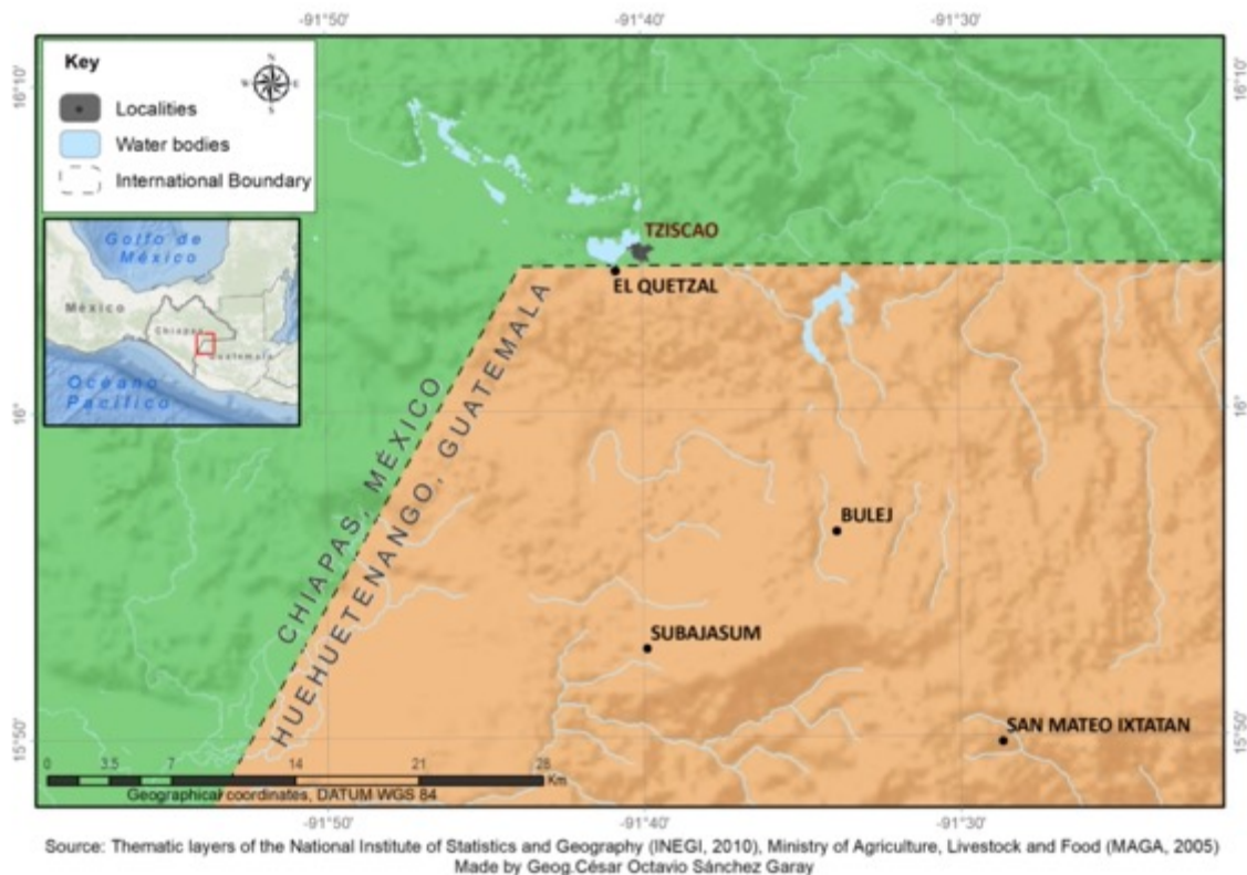
Map 2. Geographical context of the study

Developed by: César Octavio Sánchez Garay.