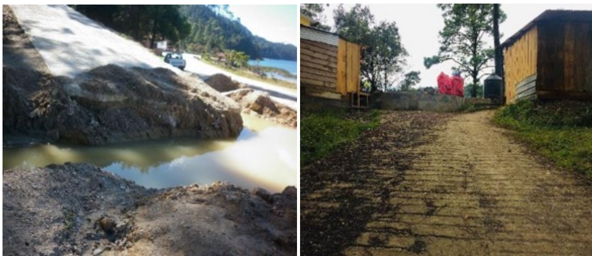
Photographs 4 and 5. Border restrictions between El Quetzal and Tzisco

Source: Ditches and wall cutting the road built by El Quetzal (Guatemala) authorities in Tzisco (Mexico). Photographs taken by the author.